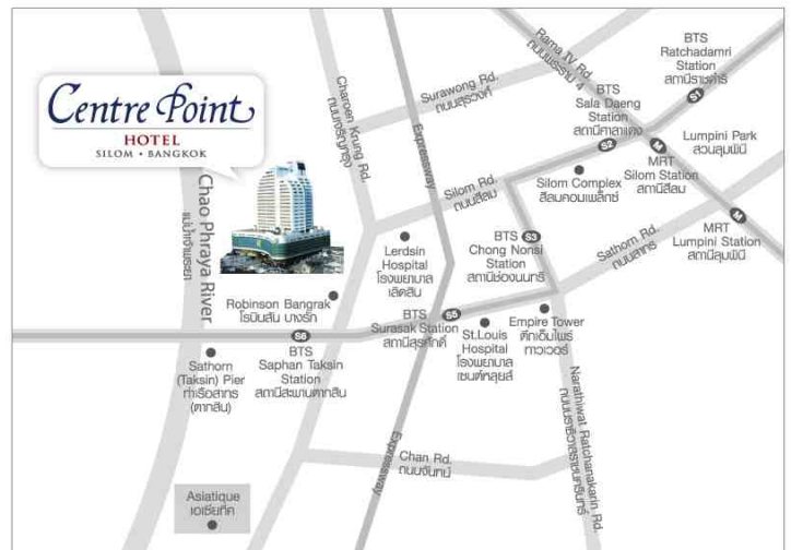
BTS Saphan Taksin Exit No.3

Close proximity to Bangkok's fast and convenient modes of transport to get you around Bangkok in a matter of minutes - BTS Skytrain Saphan Taksin Station and MRT Subway Silom Station. It is also located at the heart of Bangkok's commercial hub, surrounded by leading department stores, famous international culinary delights, entertainment and lifestyle centers.