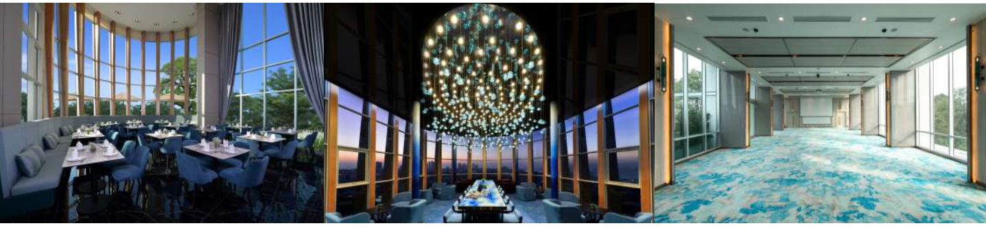
Meeting Facilities: The Hotel offers a fully functional multipurpose room with natural daylight and modern equipment.